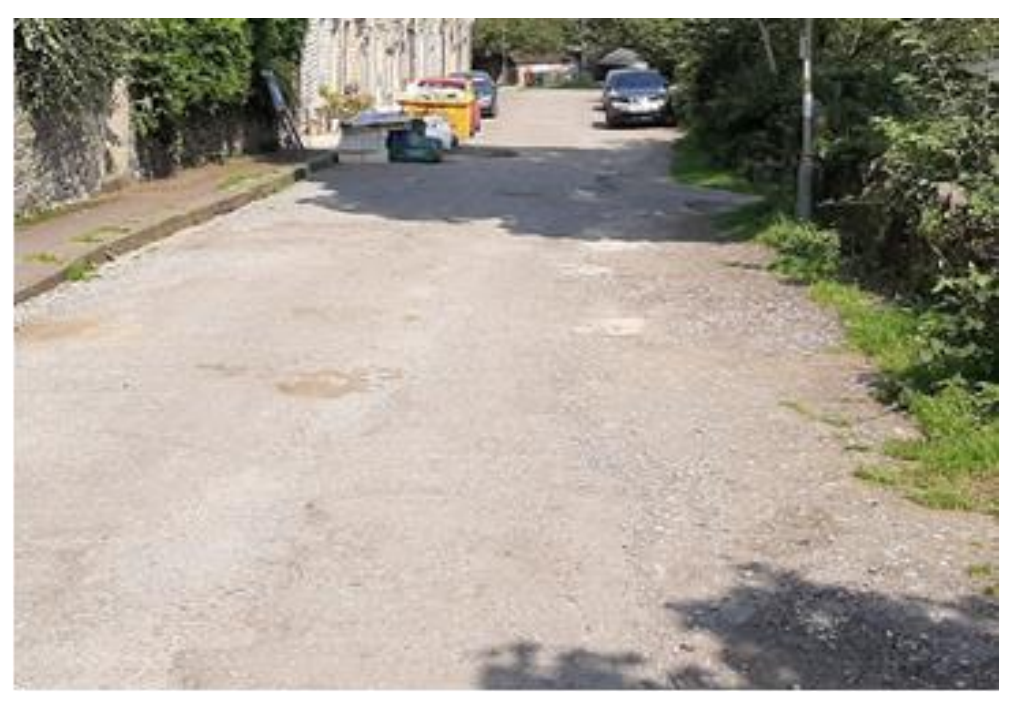
Taken July 2019.