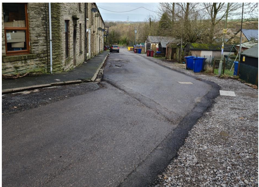
Taken January 2024